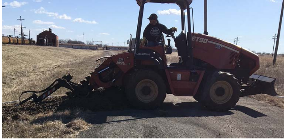
W&W Backhoe and Trenching crew member works to restore water and sewer connections to Building 920, the new home to Parsons Fertilizer.

The operation at Great Plains will process 50 tons to 450 tons of waste daily into 10 pound and 40 pound fertilizer bags, eventually working into bulk production.