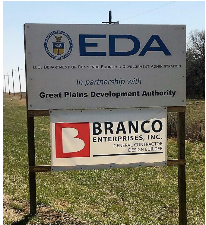
A newly erected sign at the industrial park informs tenants and visitors of the EDA funded project currently underway.

Funding for this project comes in part from a grant received from the U.S. Department of Commerce, Economic Development Administration. Earlier this year, Great Plains was awarded a $1 million grant for this infrastructure improvement. The award requires a 50% match of funds from Great Plains.