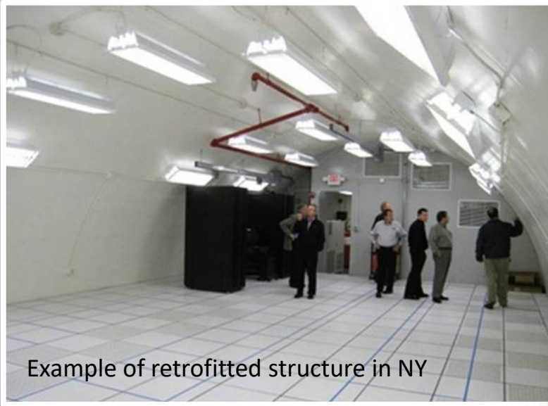
Example of retrofitted structure in NY