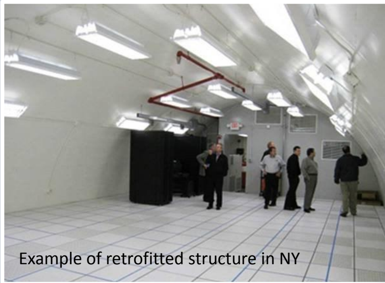
Example of retrofitted structure in NY